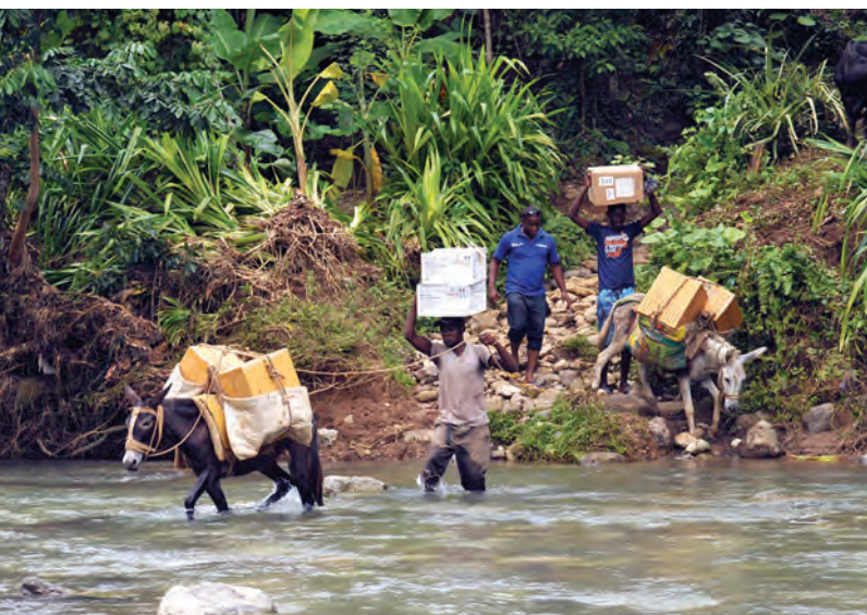
Difficult travel delivering family planning products to Dity Health Center, a remote site in northwest Haiti.