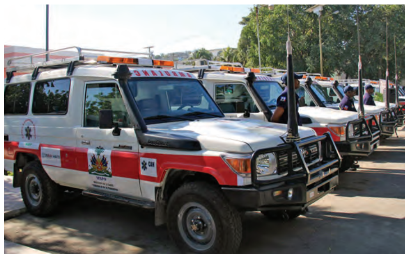
The USAID-funded LMG/Haiti project donated ten new ambulances to the Ministry of Health's national ambulance center in December 2014

antiretroviral treatment. SCMS was also instrumental in delivering emergency supplies after the 2010 earthquake and cholera outbreak.