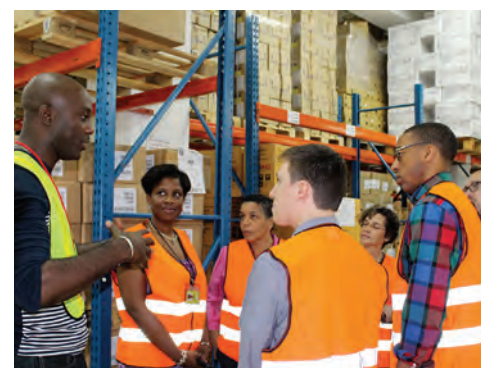
Congressional delegates tour SCMS drug supply warehouse.