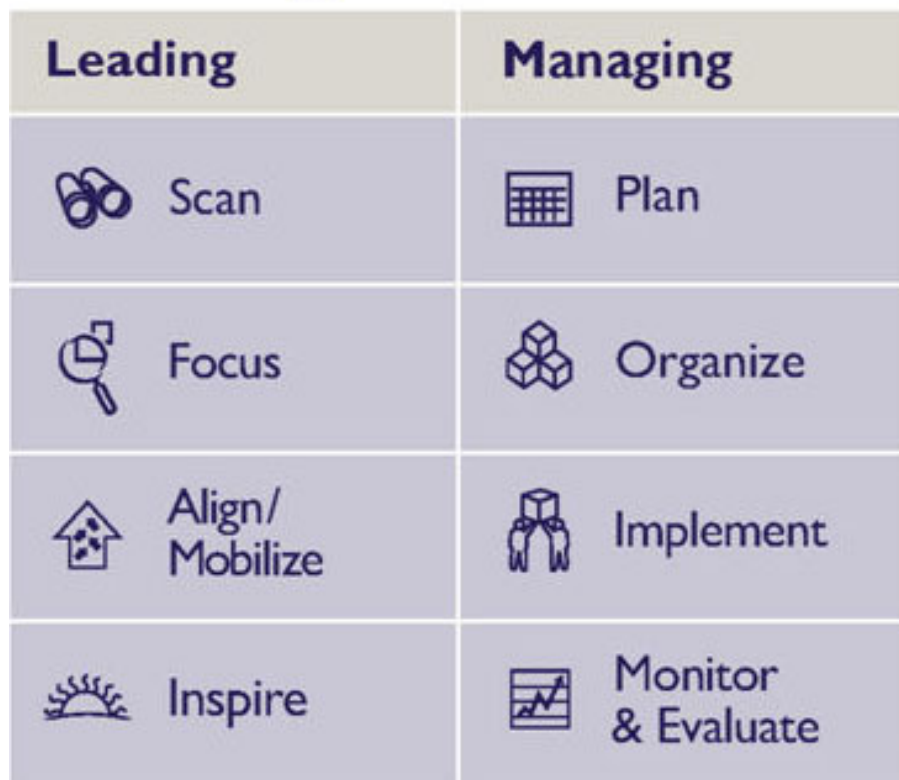
Figure 2 Leading and Managing Practices Framework.