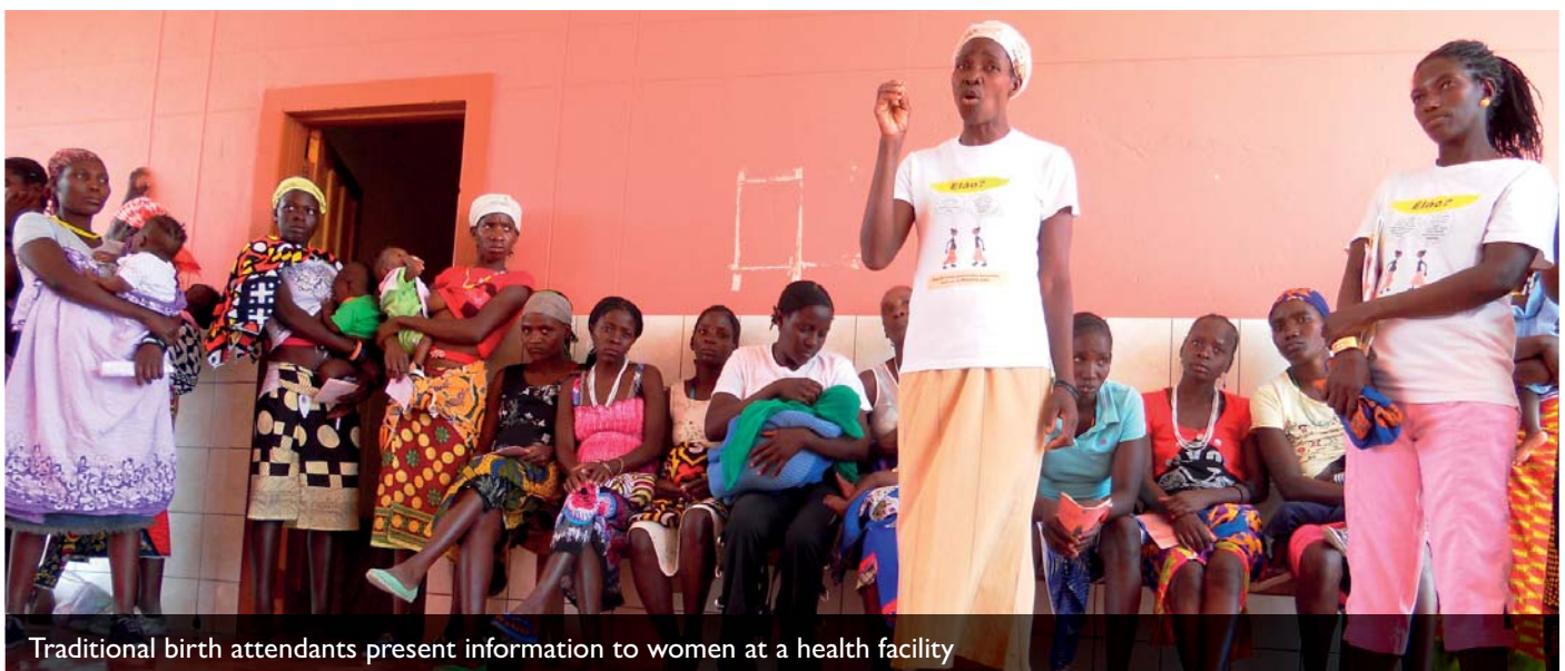
Traditional birth attendants present information to women at a health facility