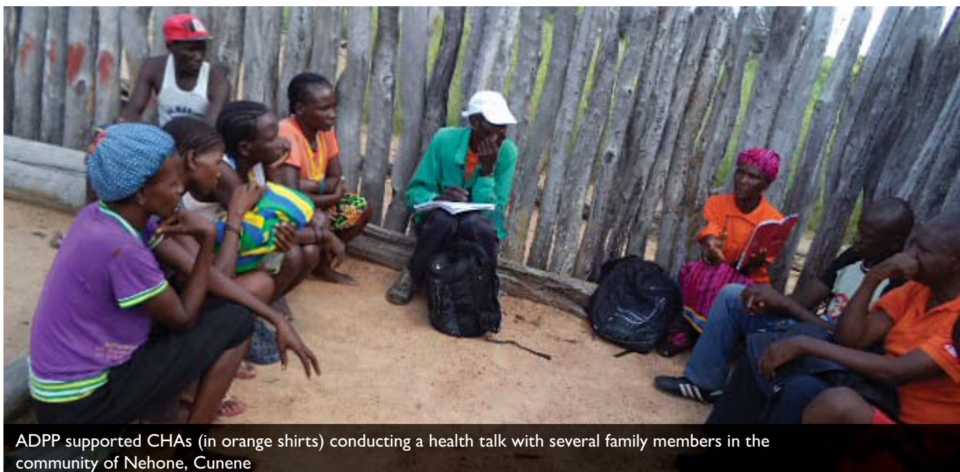
ADPP supported CHAs (in orange shirts) conducting a health talk with several family members in the community of Nehone, Cunene