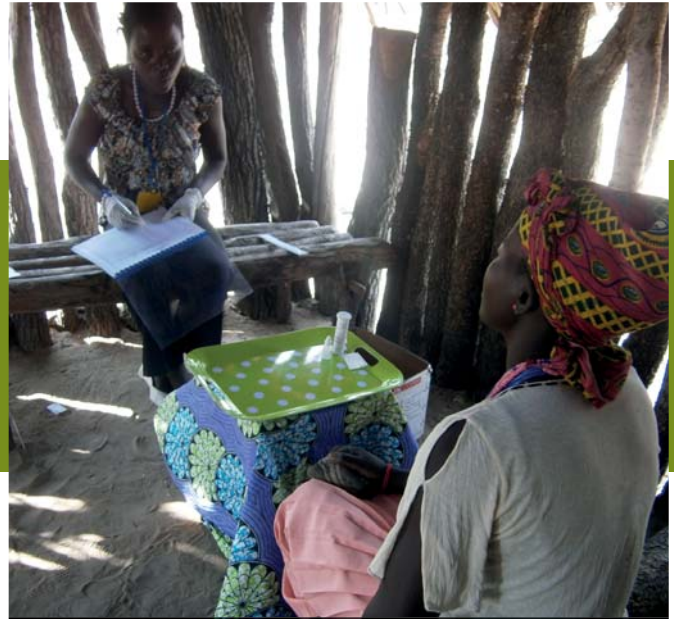
A community health worker providing community-based services to a woman in Cunene, Angola