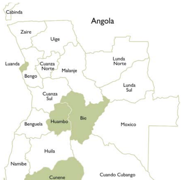
Figure 1. BLC intervention areas where CHWs are delivering services in Angola