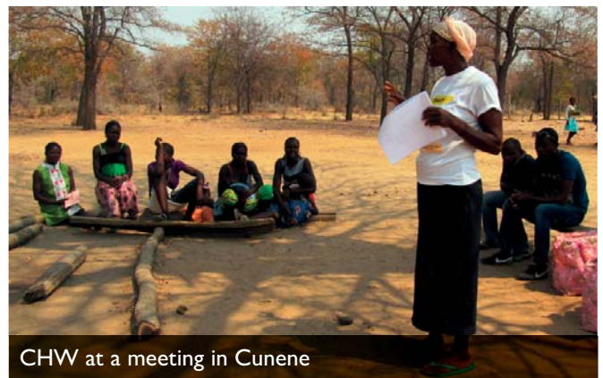
CHW at a meeting in Cunene