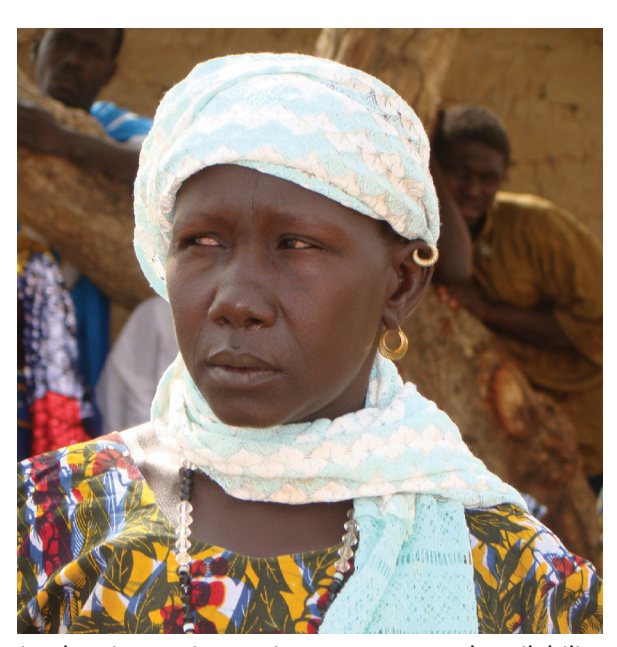
ing barriers to increasing access to and availability of misoprostol for PPH, and identified strategies for addressing them.

This report summarizes the findings of the Francophone West Africa regional survey conducted between December 2010 and January 2011. Eighteen organizations working at the regional level described their activities, shared their motivations for involvement in misoprostol work, discussed prevail