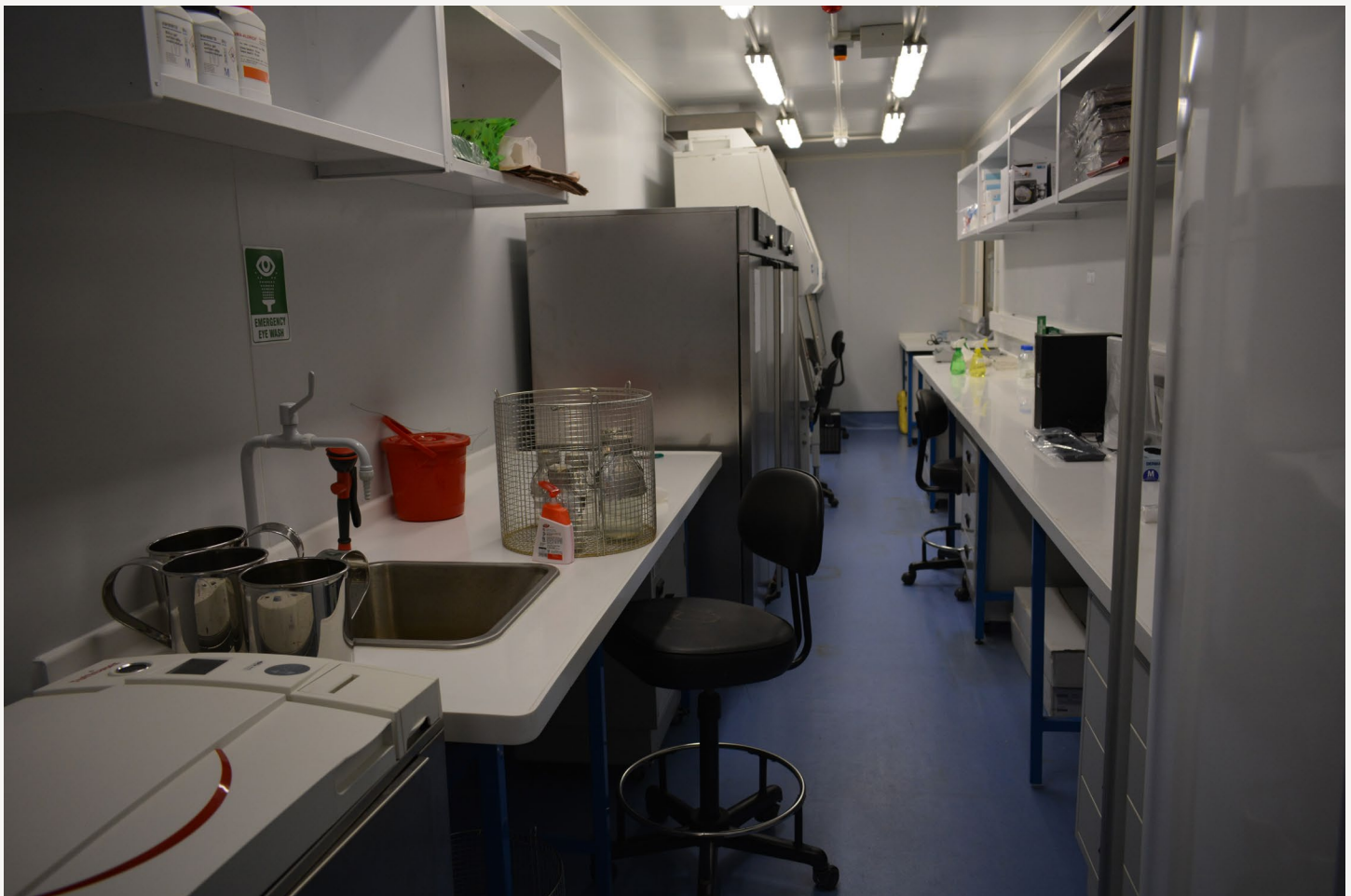
Inside the BSL-3 lab

and connect the power supply. The government department of fire and environmental ministry were involved in the review of fire safety issues. The city corporation of Sylhet helped put a fence around the site. Civil society members in Sylhet worked to expedite the process. The project needed to engage all those actors to establish and operationalize the lab. Splitting the cost evenly between the GoB and CTB set a new precedence for cost sharing for the donor and implementers.