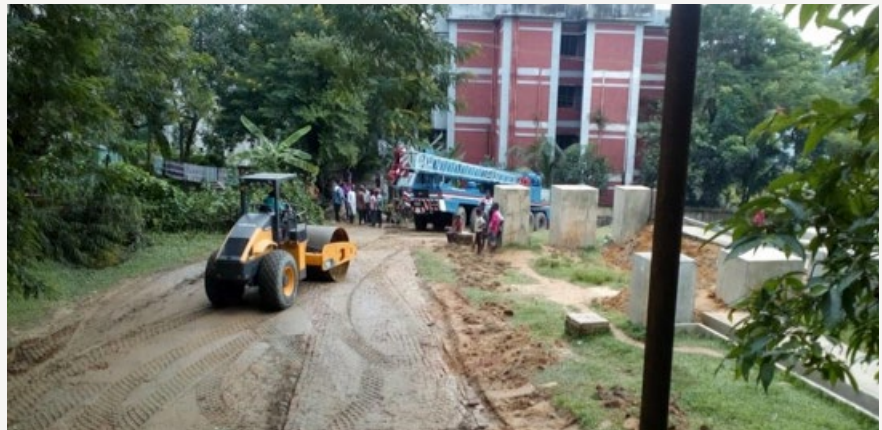
Site preparation for placement of the BSL-3 lab