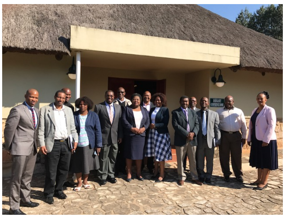
Group photo of the principal secretaries and senior managers' breakfast meeting from MOH, MOA, and MONRE

After finalization of draft-one of the National AMR Containment Strategic Plan, it was presented to the principal secretaries and senior managers of MOH, MOA, and MONRE on July 25, 2017, at the Emafini Country Lodge in Mbabane. The principal secretaries and senior managers went through the document and made their inputs. The main input was that the document includes an M&E plan. The committee was then tasked with making the final additions. SIAPS provided support for technical review and editorial review. The AMR containment strategic plan has been finalized and is awaiting signing by the signatories from the three ministries, after which it will be ready for printing and launch.