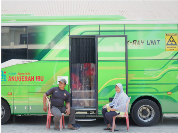
Photo: Participants wait to be screened for TB using a mobile x-ray machine at Puskesmas Helvetia, North Sumatra, in January 2024.

To support intensified case finding (ICF) and active case finding (ACF), USAID BEBAS-TB promotes the screening of patients for TB and continued treatment for those affected by TB or latent TB.