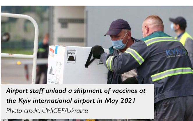
Airport staff unload a shipment of vaccines at the Kyiv international airport in May 2021