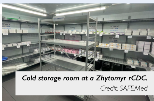
Cold storage room at a Zhytomyr rCDC.