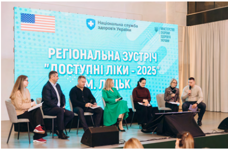
Opening session of the Affordable Medicines regional meeting.

This year has marked unprecedented AMP expansion. The state now reimburses the cost of 705 medicines, including 273 available at no cost to patients. For the first time, the program covers medicines for pregnant women, children, and cancer patients, including those with breast cancer. Medicines for conditions already included in the program such as cardiovascular, endocrine, autoimmune, mental, and behavioral disorders have also expanded.