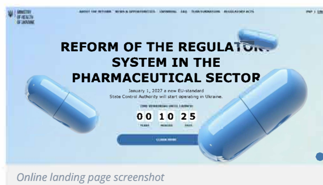
Online landing page screenshot

The landing page is publicly available at https://uma.gov.ua/en .