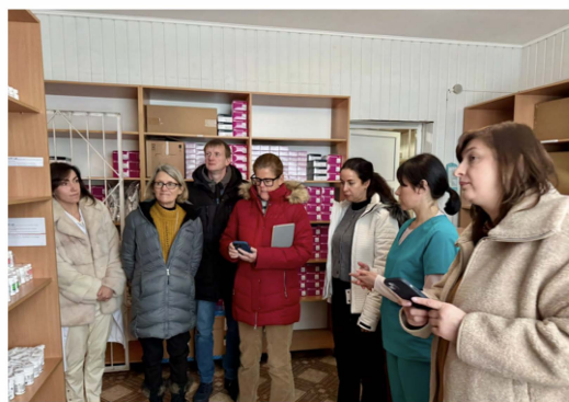
Monitoring visit delegation touring the Center's warehouse

On January 29, 2026, SAFEMed accompanied U.S. Government representatives on a monitoring visit to the Center for Infectious Diseases of the Ivano-Frankivsk Regional Council to review implementation of U.S. Government-supported activities and regional coordination of HIV services.