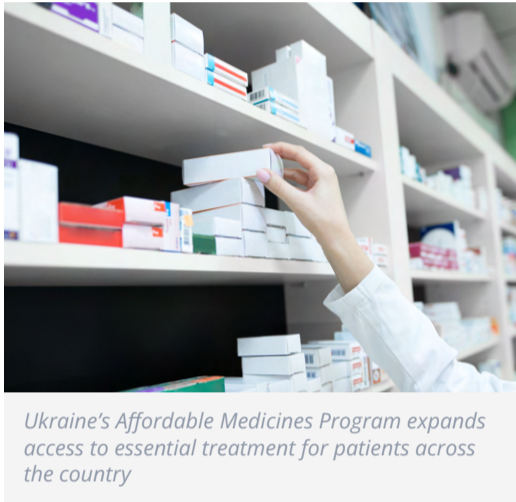
Ukraine's Affordable Medicines Program expands access to essential treatment for patients across the country

Ukraine has expanded the Affordable Medicines Program (AMP), adding 37 new medicines and increasing access to treatment nationwide. Approved by the Ministry of Health of Ukraine and effective March 31, 2026, the program now includes 748 medicines and medical devices, with 279 of these provided free of charge to patients.