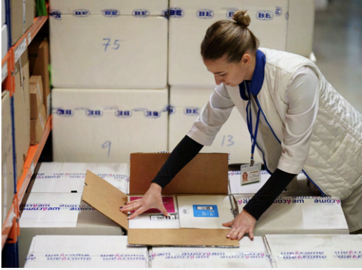
Effective supply management helps ensure continuous availability of medicines across Ukraine

Recent regulatory updates approved by the Ministry of Health of Ukraine (Order No. 327, March 16, 2026) introduce new requirements for how medicines and medical devices are planned, procured, and monitored.