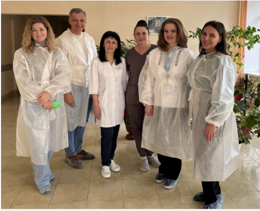
Monitoring team during a regional visit in Vinnytsia, assessing implementation of the updated immunization schedule, April 2026.

SAFEMed, in partnership with the Center for Public Health (CPH) and WHO, continues supporting the nationwide implementation of Ukraine's updated immunization schedule through a series of regional monitoring visits. In April 2026, monitoring visits were conducted in Vinnytsia (April 16–17) and Khmelnytskyi (April 23–24), bringing together national and regional stakeholders to review implementation progress and identify operational gaps requiring additional support.