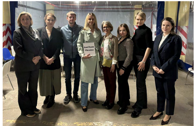
The meeting took place in a shelter due to the security situation in Kyiv, underscoring stakeholders' continued engagement despite ongoing challenges.

The meeting helped maintain an open dialogue between SAFEMed and private-sector stakeholders while supporting continued engagement around key pharmaceutical reforms shaping Ukraine's health sector.